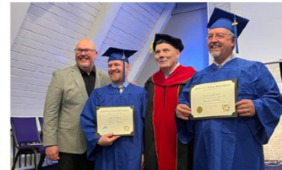
Friendsville, MD Campus