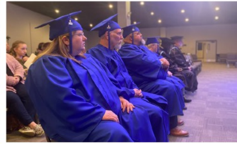
Fairmont, WV Campus