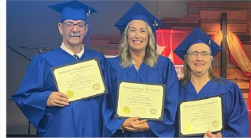
New Florence, PA Campus