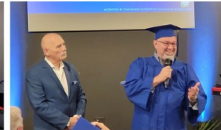
Arden, NC Campus