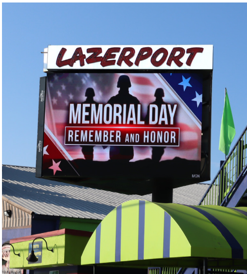
Outdoor 8' x 12' 6mm