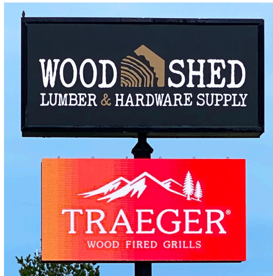
Outdoor 6' x 12' 8mm