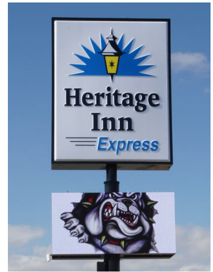
Outdoor 4' x 8' 10mm