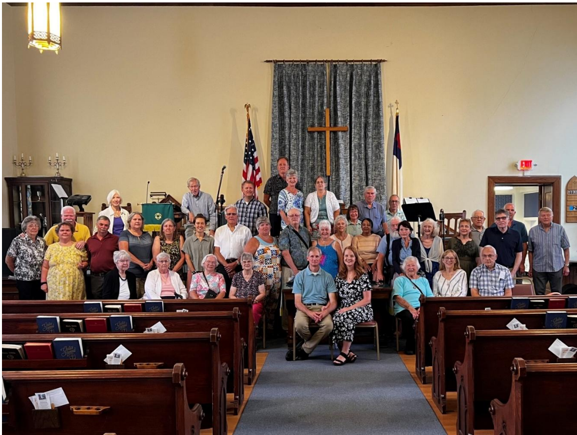
RING OUT THE OLD! One of the last photos taken in our vestry before we moved all the pews aside to make way for construction!