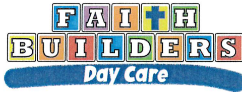
Photo Release Form

I, _____, the parent of child/children at Faith Builders Day Care agree to the following: