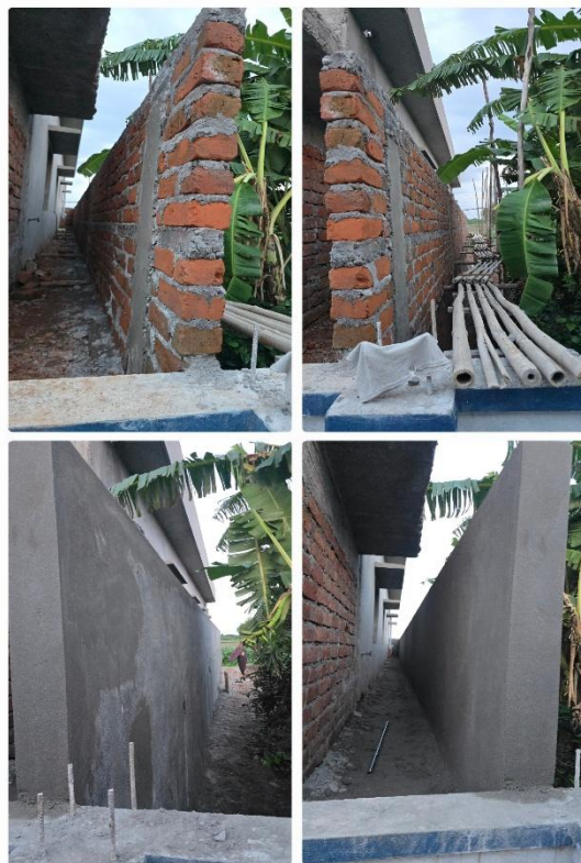
CFMI building backside fencing wall

We are confident that He is the ultimate architect and builder of this home, and we are honored to serve as His instruments, with your valued support.