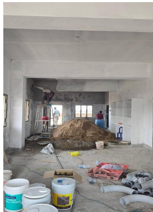
CFMI building inside after 1 coating of paint