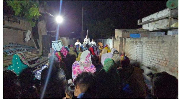
Murikipudi gospel meeting

Preach the message; be persistent in doing so, whether in season or out of season convince, reprove, and encourage, but with great patience and instruction.