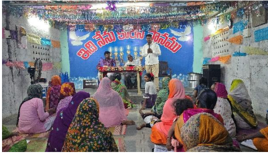
Zulakallu gospel meeting