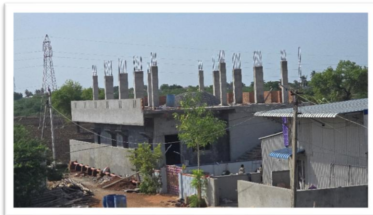
CFMI construction building

Click Weekly construction progress photos are available via Google Photos lin