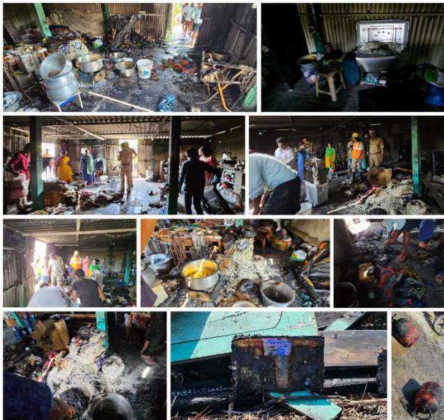
After fire accident