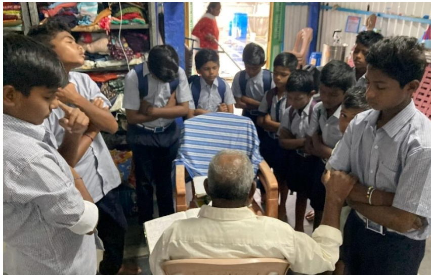
The children's first day of school started with prayer

Our children have started another academic year; the summer holiday is over. They were all advanced to the next class. We purchased new shoes and uniforms for the children. In the picture, you can see their new uniforms. Please pray for their new academic year. Pray for wisdom, knowledge, and to understand the subjects they are studying.