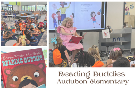
Reading Buddies Audubon Elementary