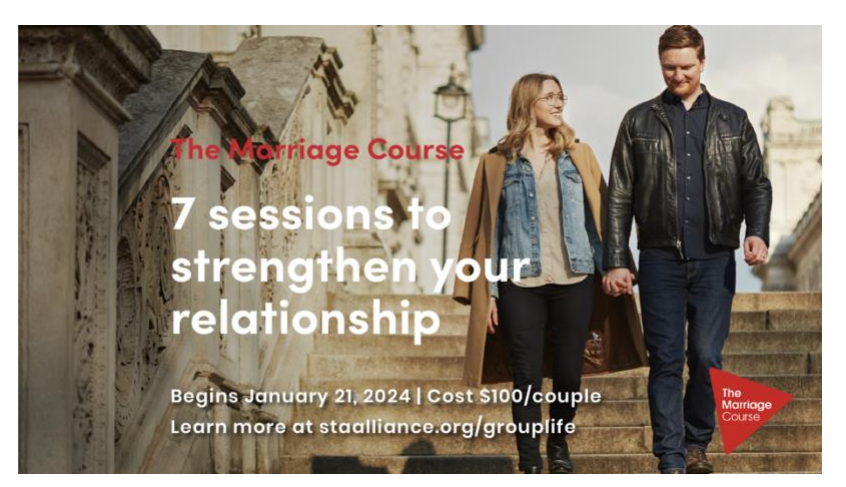
Learn more about The Marriage Course at staalliance.org/grouplife