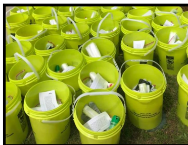
Each bucket contains specific items used for a specific purpose during clean-up after a tornado.