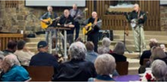
Bridge Builders Luncheon