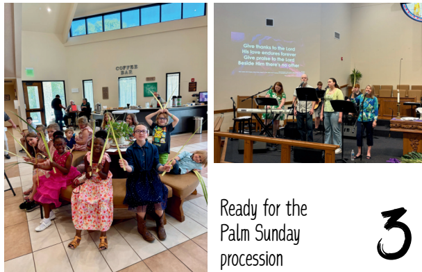
Our Praise Band