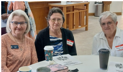
United Women in Faith - Leadership Training