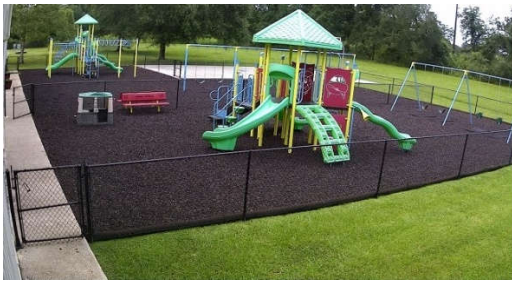
LITTLE KID PLAYGROUND