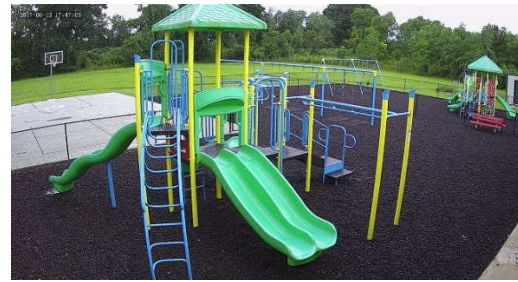
BIG KID PLAYGROUND

This playground is exclusively for little ones up to 5 years old.