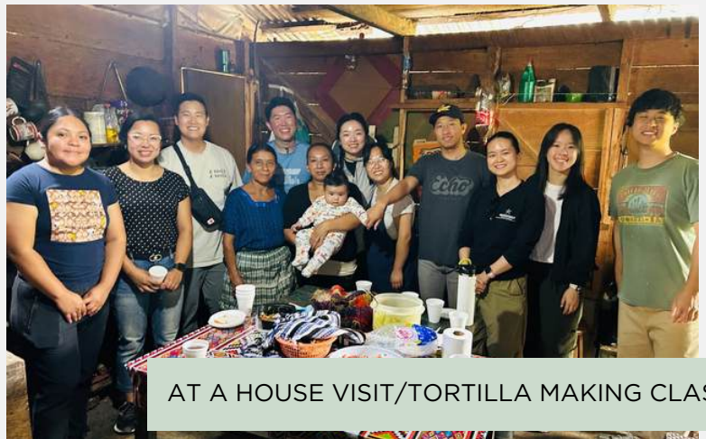
AT A HOUSE VISIT/TORTILLA MAKING CLASS