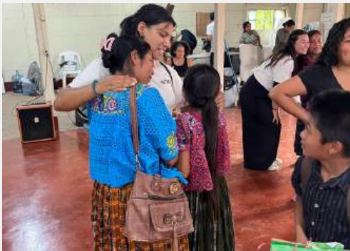
PRAYING OVER THE KIDS

In addition to the camp, the team also made house visits to meet families and pray with them.