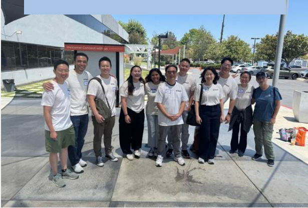
COS ANAHEIM TEAM