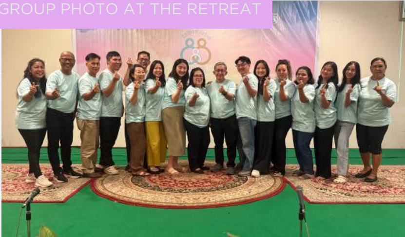
GROUP PHOTO AT THE RETREAT