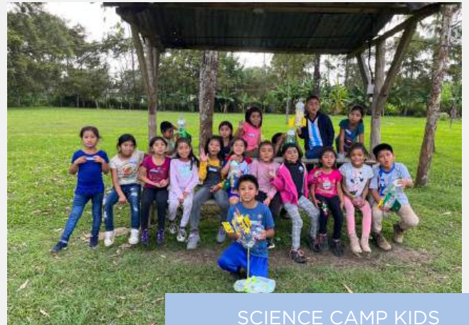
SCIENCE CAMP KIDS