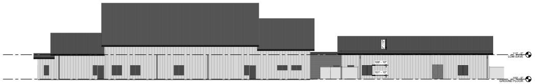
2 WEST ELEVATION 3/32" = 1'-0"