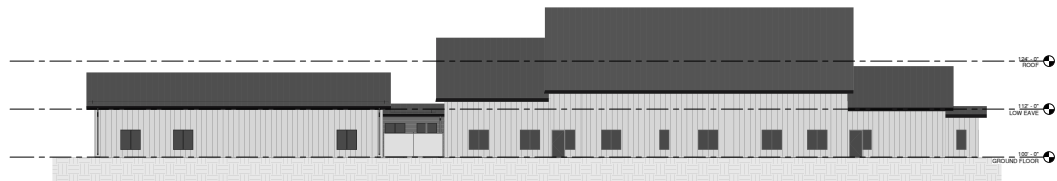
1 EAST ELEVATION 3/32" = 1'-0"