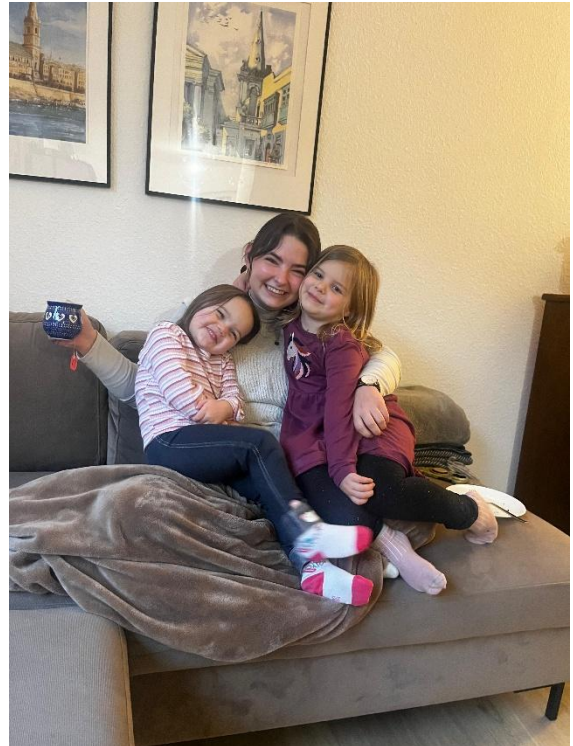
Other missionary kids that dubbed me their "Sparkle Best Friend"—a title I 100% embraced, though I think I mostly got it because they couldn't remember my name. ✨