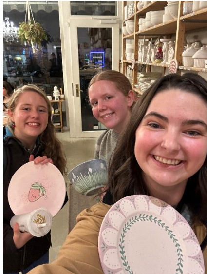
The girls' day out for their birthdays which included bubble tea and pottery painting 🍷 🎨

in the hospital for the birth of their new little boy. Something I felt so honored they trusted me to do. The girls were easy on me, we had lots of fun, and I only forgot the 2-year-old's shoes once (and we didn't make it very far before she let me know her feet were cold!). I also took my boss's two teenage girls out for a day to celebrate both of their birthdays that happened over the Fall. I remember how special it was to me growing up to have aunts and other godly women around me. Those whom I could look up to, spend time with, and who would disciple me. I feel God has now put me in a position to be that person for other girls.