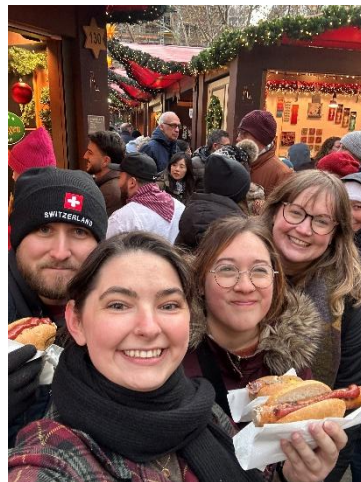
More Christmas markets!