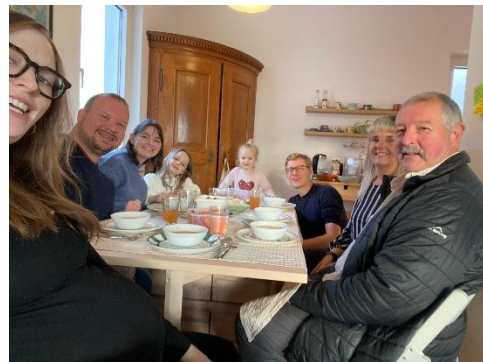
Church at my house!

My home continues to bless me and has also become a safe and warm space for friends on weekends and odd evenings. Something I prayed for was friends to come around me that would feel like family. The day I recognized God had answered this prayer was so sweet as I reflected on the neighbors that surprise me at my door with an invitation to join them for a walk or the friends that are eager to come over and make cookies during the week or for a puzzle and pizza on the weekend.