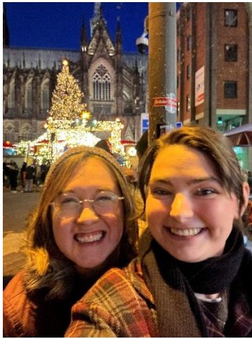
Even more Christmas markets!