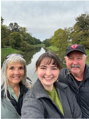
My parents and I on a walk by the river close to my house