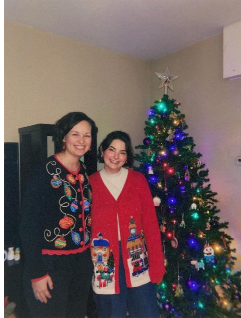
Work Christmas party!