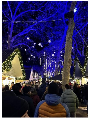
Okay, I went to a lot of Christmas markets