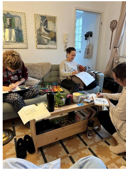
An “Everybody bring your own craft day” in my home 🧶