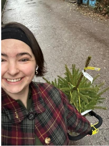
Bringing my Christmas tree home on my little grocery wagon