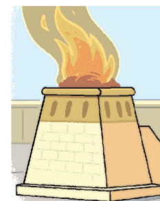
BRONZE ALTAR FOR SACRIFICING