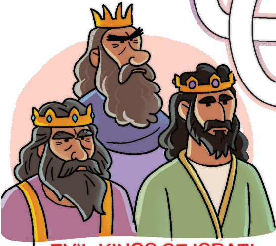
EVIL KINGS OF ISRAEL