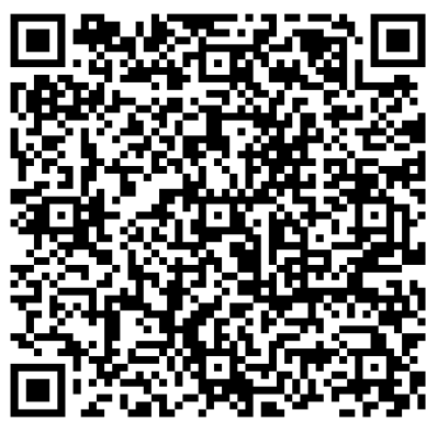
Scan for Android App