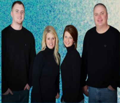
Voices Of Praise Singing Singing on the 24th