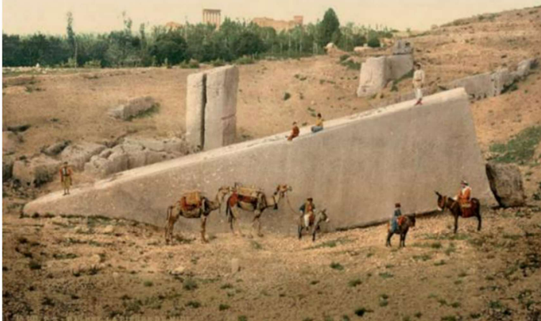
The Stone of the Pregnant Woman, photographed between 1890 and 1900, at Baalbek in Lebanon. (Public domain)