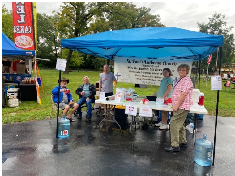
The St. Paul's coffee booth at the Dellwood Park Car Show on August 17

Evil angels, or devils, are spirits who were created holy, but sinned and are forever rejected by God (2 Peter 2:4). Like good angels, they are personal beings who really exist. There is no redemption for them, like with man. For now they roam the earth by God's permission (Job 1:7) but will one day be cast into everlasting fire (Matthew 25:41). Evil angels are cunning, powerful and of great number (Ephesians 6:12; Mark 5:9). They are enemies of man and God and endeavor to destroy the works of God (John 8:44; 1 Peter 5:8-9). They usually work by deceit and temptation. Christ is far more powerful than all of them, and has delivered us from the power of the devil, so we can resist him in faith and overcome them with the Word of God.