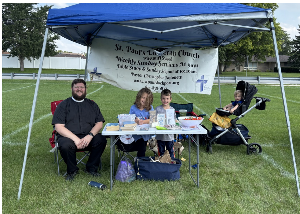
Pastor with some members at the St. Paul's booth at the Lockport Police CommUNITY event at East High School on August 2.