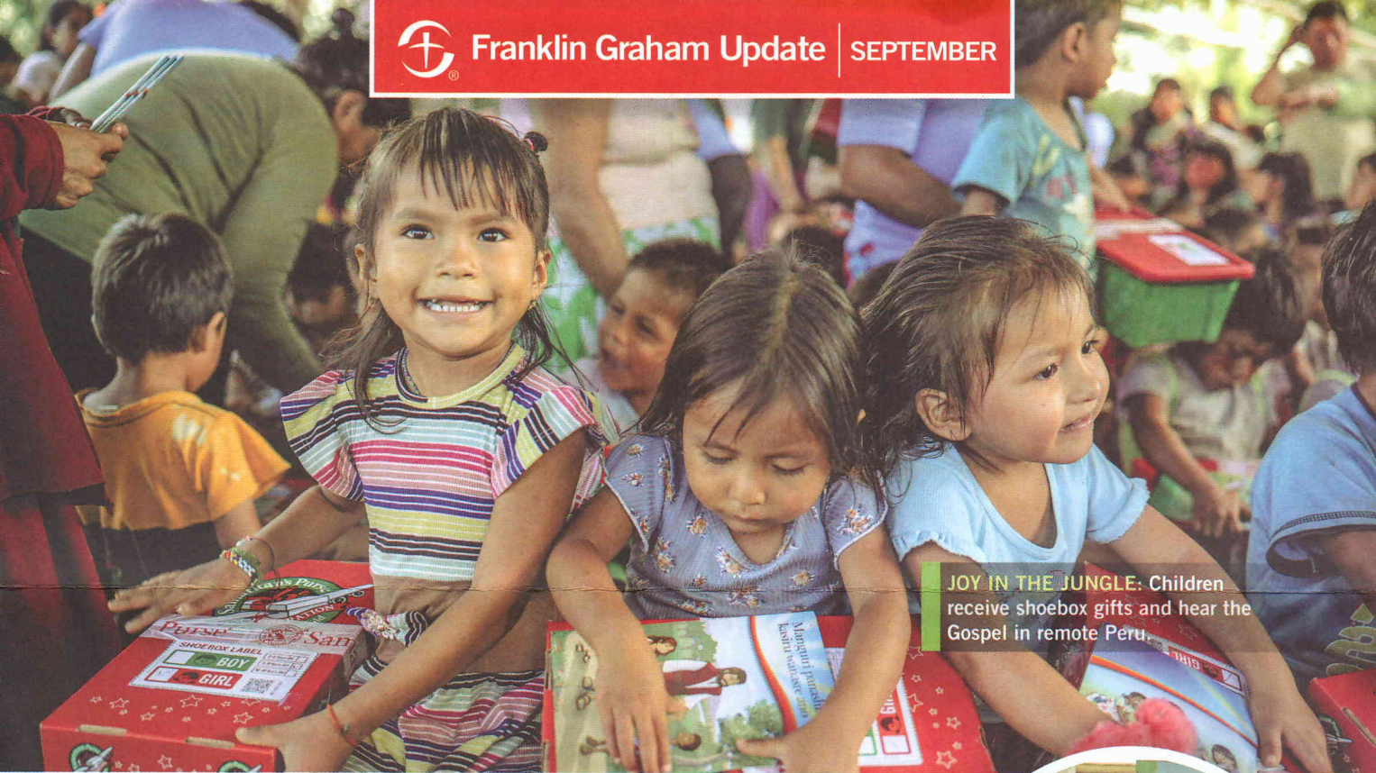
JOY IN THE JUNGLE: Children receive shoebox gifts and hear the Gospel in remote Peru.