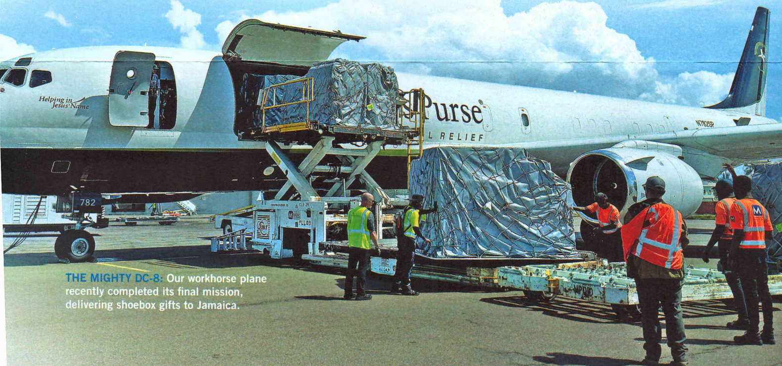
THE MIGHTY DC-8: Our workhorse plane recently completed its final mission, delivering shoebox gifts to Jamaica.