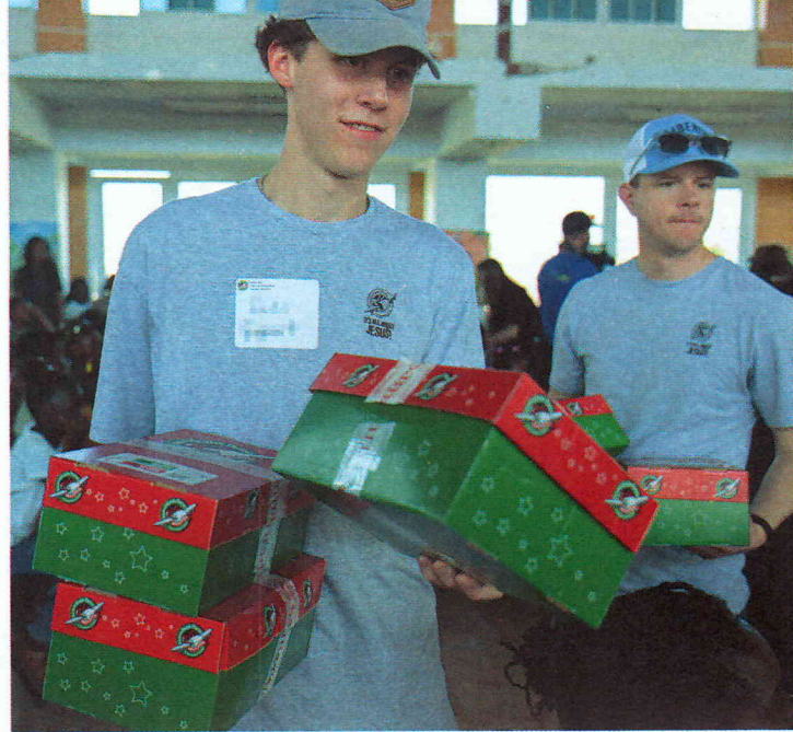
IT'S ALL ABOUT JESUS: Liberty University leaders and students traveled to Jamaica to deliver Operation Christmas Child gifts to boys and girls in need.

man I met was so thankful to have his roof tarped and said it was the first dry night he had spent since the hurricane weeks ago! More than 300 Disaster Assistance Response Team (DART) members have been on the ground during this response, and we've helped more than 25,000 families.