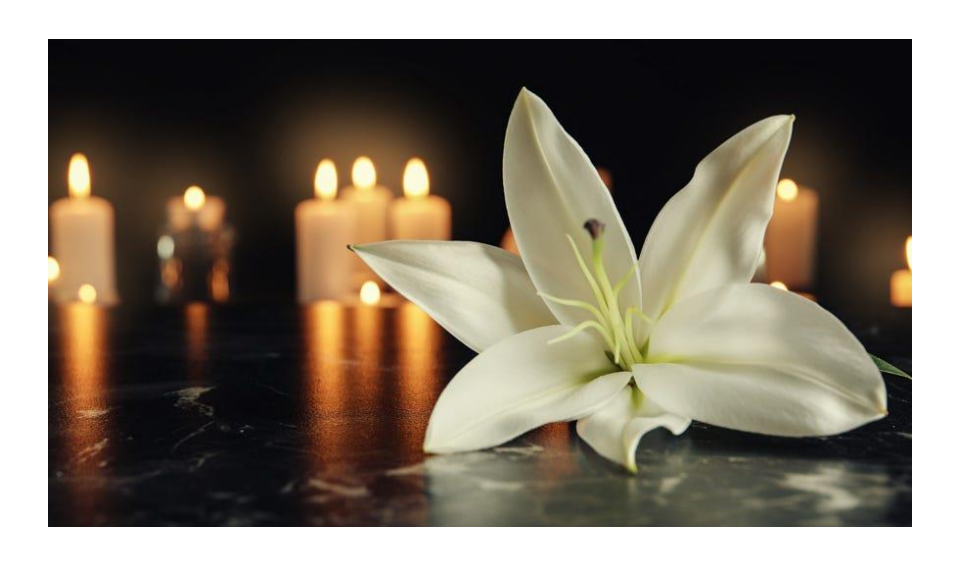
at Liberty Corner Presbyterian Church