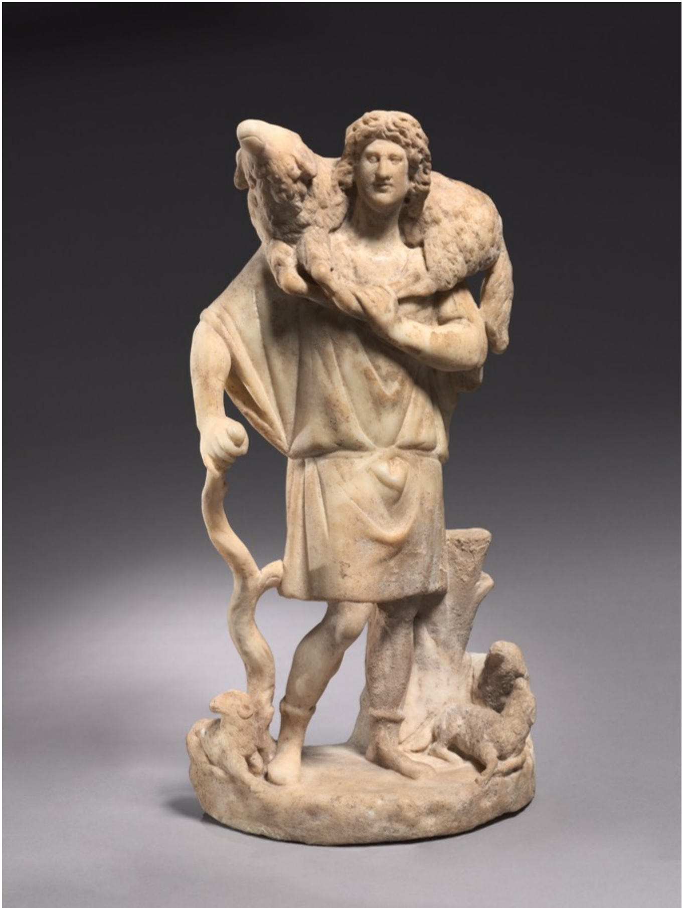
Lesson II artwork: The Good Shepherd (280-290) | Anatolia, late Roman-early Christian