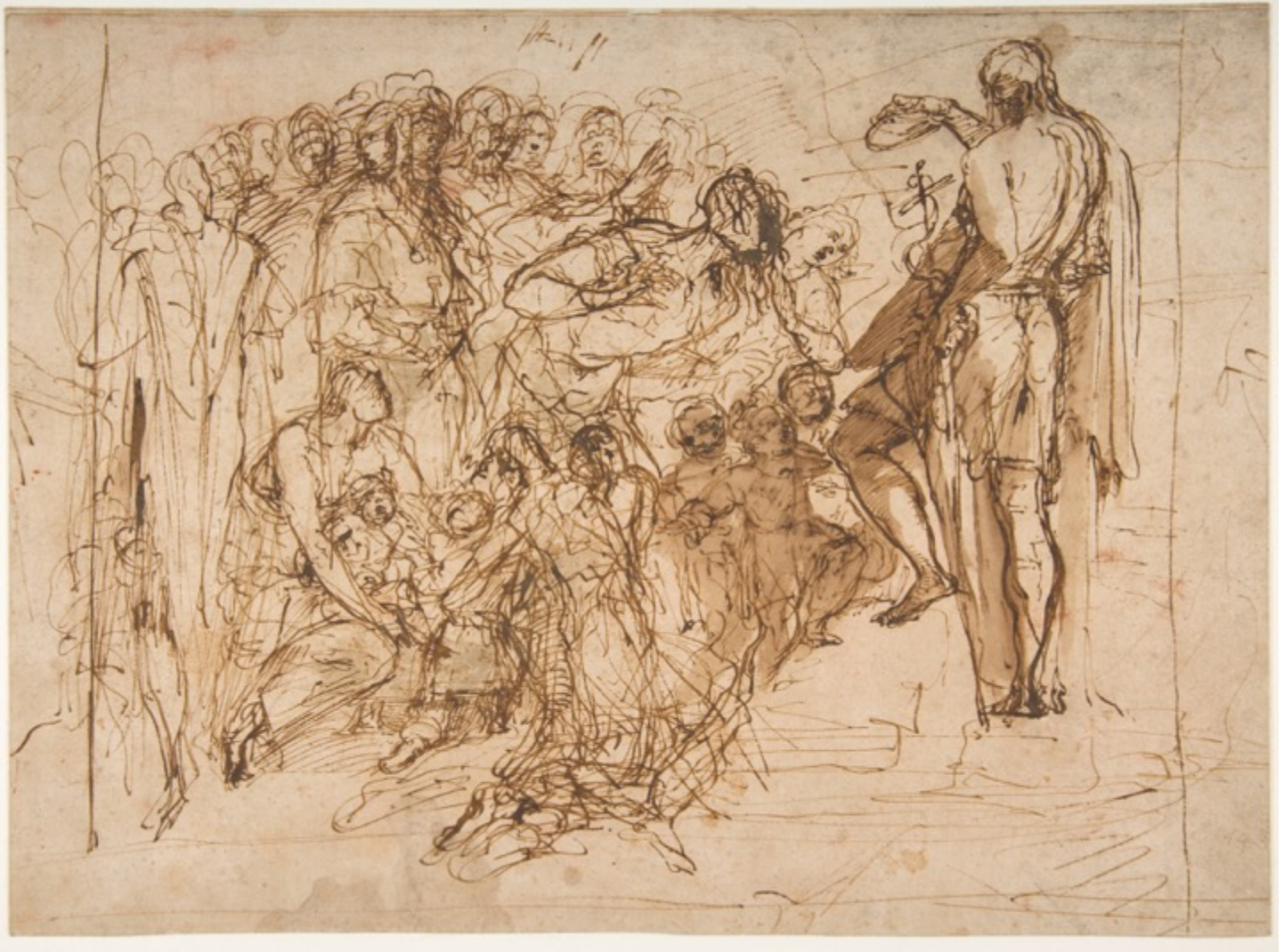
Lesson VI artwork: St. John the Baptist Baptizing the Multitude (1555) | Pelegrino Tibaldi (1527-1596)