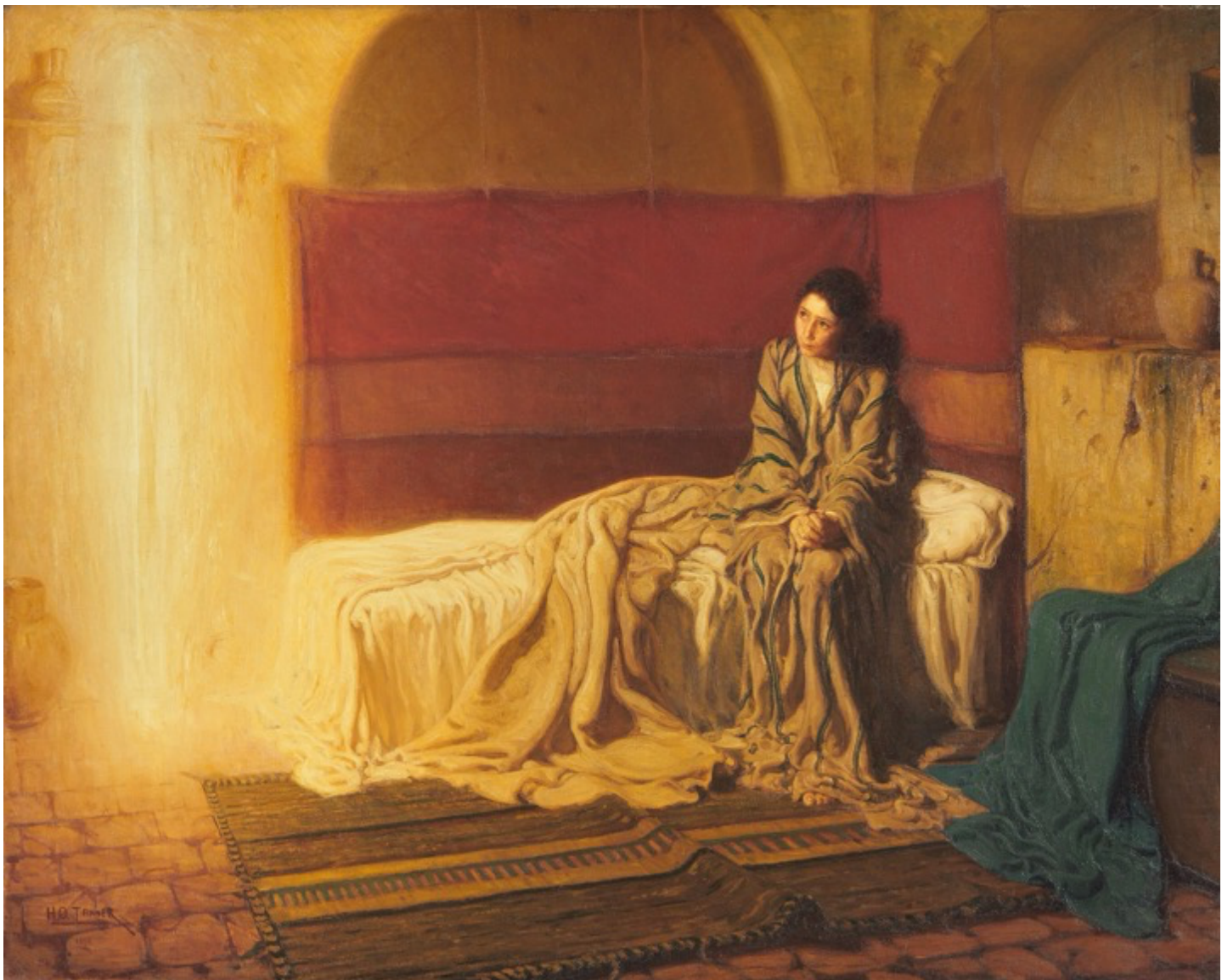
Lesson VIII artwork: The Annunciation (1898) | Henry Tanner (1859-1937)