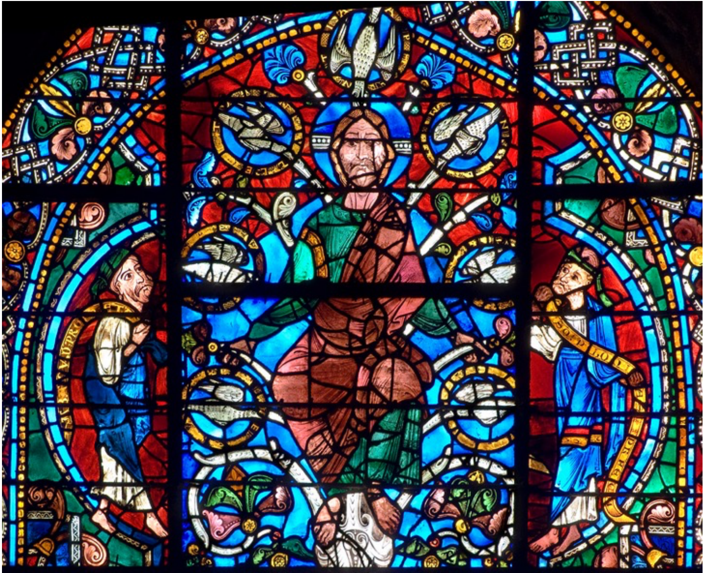
Lesson V artwork: Christ with the Seven Gifts of the Spirit , detail from “Tree of Jesse” (c.1150), Chartres Cathedral