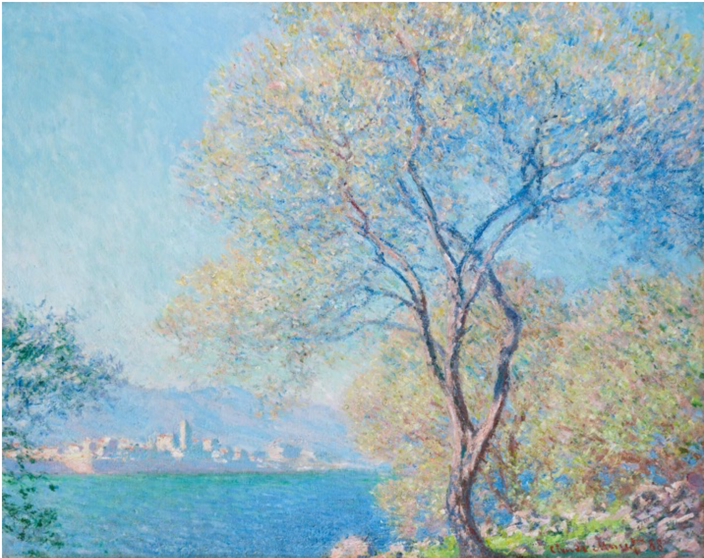
Lesson VII artwork: Antibes Seen from La Salis (1888) | Claude Monet (1840-1926)