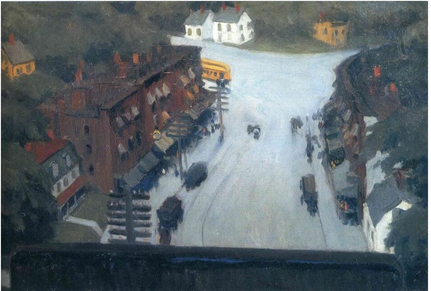
Lesson IV artwork: American Village (1912) | Edward Hopper (1882-1967)