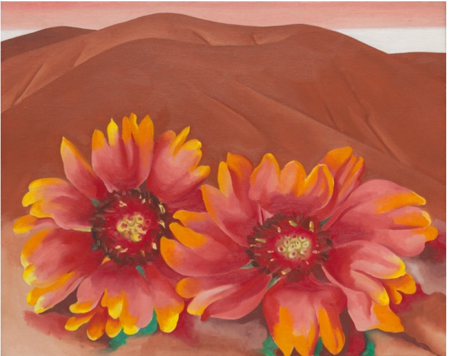
Lesson III artwork: Red Hills with Flowers (1937) | Georgia O'Keeffe (1887-1986)