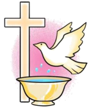
River Jamie Balla Baptized: 1/23/2022 Parents: Justin & Dayna Balla

If you are interested in scheduling a baptism or joining the church, please contact the church office at office@westlawnumc.org / 610-678-5611 or one of the pastors.