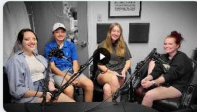
28. Seniors of 2022 Jun 21, 2022