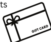
Gift Card Tree Worth at least $250

Contact Trisha@westlawnumc.org for more info