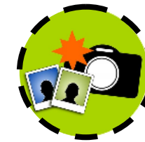
PHOTO SCAVENGER HUNT