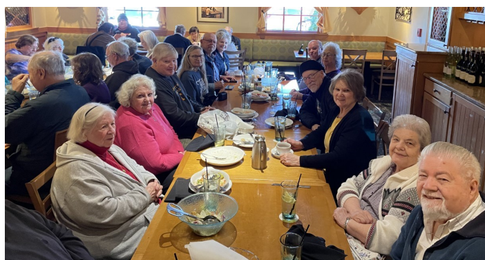
A fun time was had by the JOY Group at their outing to the Olive Garden in Spring Hill.