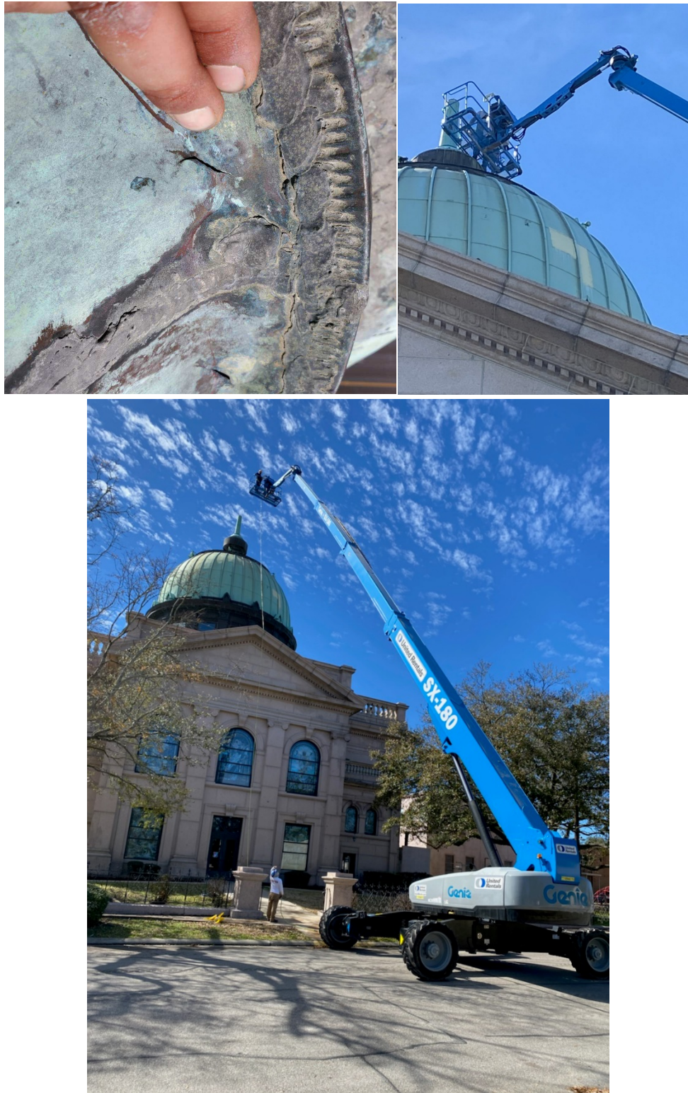
Dome Leak Repair