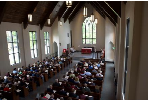
University Lutheran Chapel's nave and chancel.