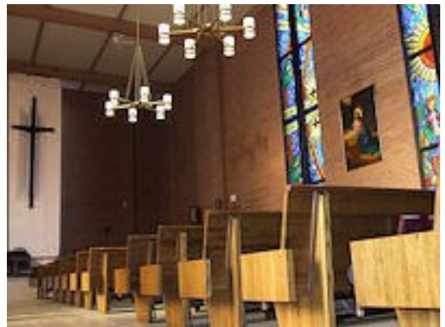
Inside our Sanctuary.