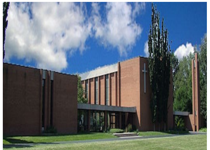
St. John's in the summer sun