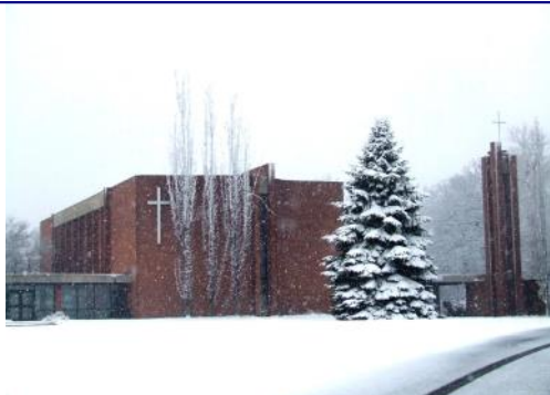
St. John's in Winter Snow