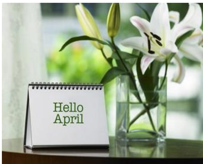
Inside our Sanctuary.