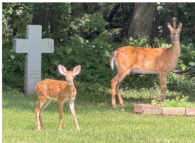
God's creatures by our bell tower

Monday – Thursday 8:30am– 2:00pm Closed for lunch from 12-1pm