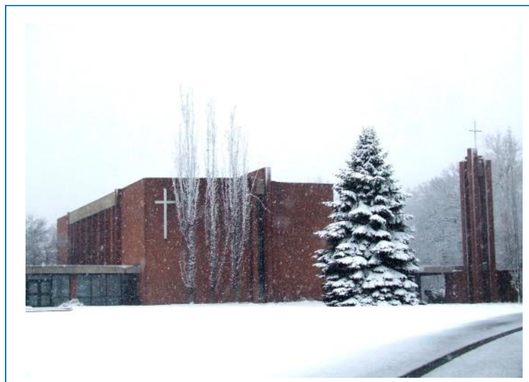
St. John's in Winter Snow