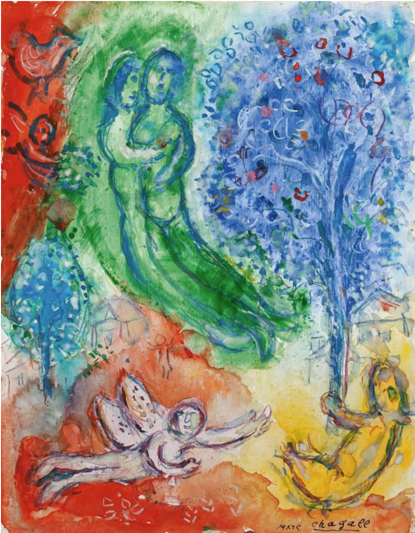
The Garden of Eden by Marc Chagall