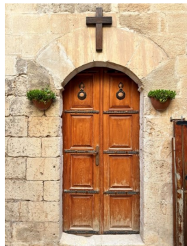
image: Masked gunmen connected to ISIS entered a Turkish church and killed a man inside.

On Sunday, January 28, two masked gunmen entered a Catholic church in Istanbul during a service and randomly shot and killed a 52-year-old man. The self-proclaimed Islamic State (ISIS) claimed responsibility. Turkish police quickly arrested two suspects with ties to ISIS and later arrested 25 more after raiding numerous locations. Afterwards, police contacted a pastor of a rapidly growing church in another part of Turkiye and told him that his name was on an ISIS hit list. "This pastor has been threatened by ultra-nationalist Turks many times, but this was the first time that he sounded worried," said a front-line worker. Turkish police offered to protect the pastor and encouraged him to set up security cameras. "We can't pray for the elimination of persecution," said the front-worker, "but we can pray that believers will be strengthened and recognize these things are happening because of the growth of the church."