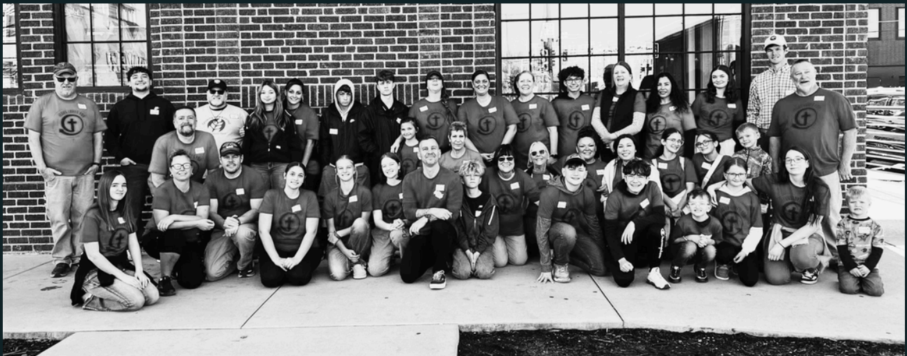
"Recycle God's Love" Thanksgiving outreach event team serving in downtown Denver

In order to streamline our meeting, please take the opportunity to review, online, the minutes from the 2025 Annual Meeting. These minutes will have to be approved at the upcoming meeting. You can review these minutes on the church website at https://tinyurl.com/SCC2025minutes