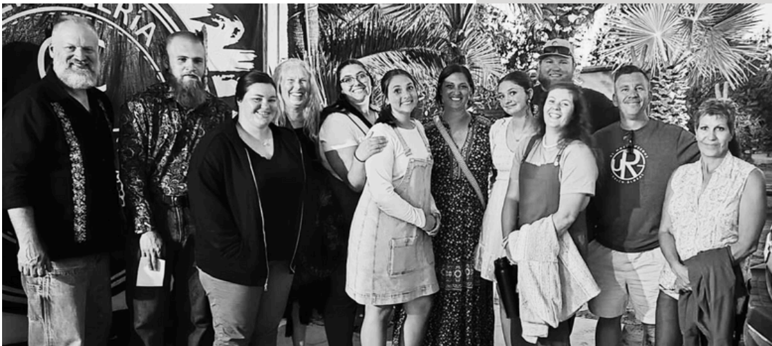
Baja, Mexico Missions trip team

Growing where planted toward intimate faith, compassionate servanthood, authentic community, and relational outreach