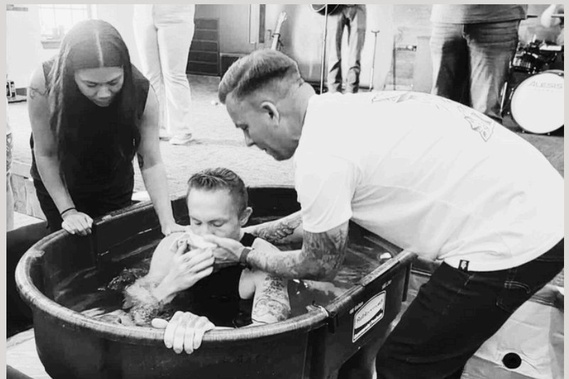
Baptisms on Sunday, August 31st