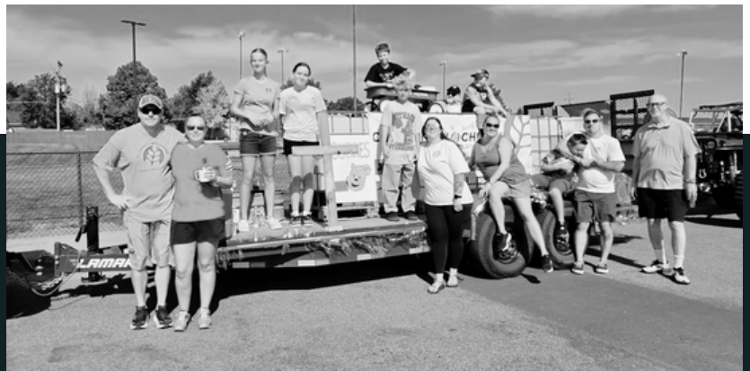
Strasburg Hometown Days float