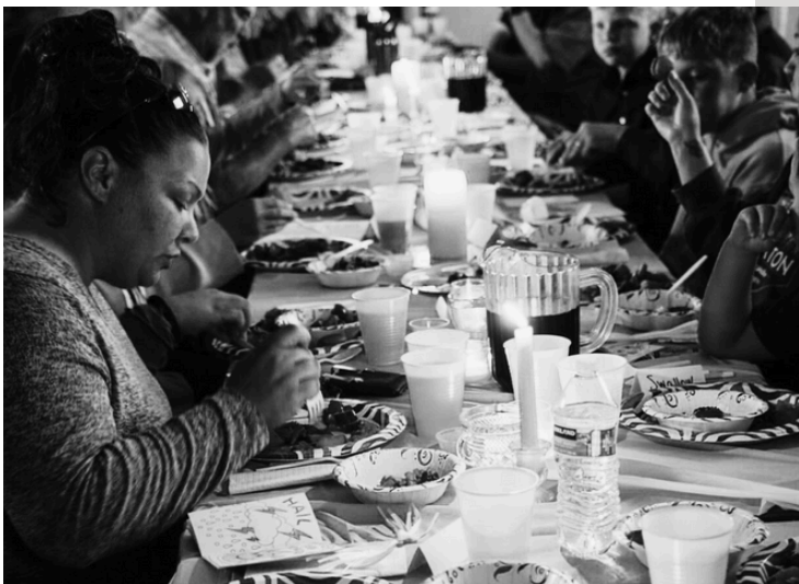
Passover Seder dinner at the church