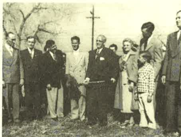
Ground Breaking 1951