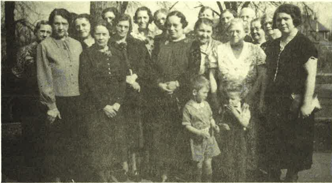
Women Missionary Society, 1938