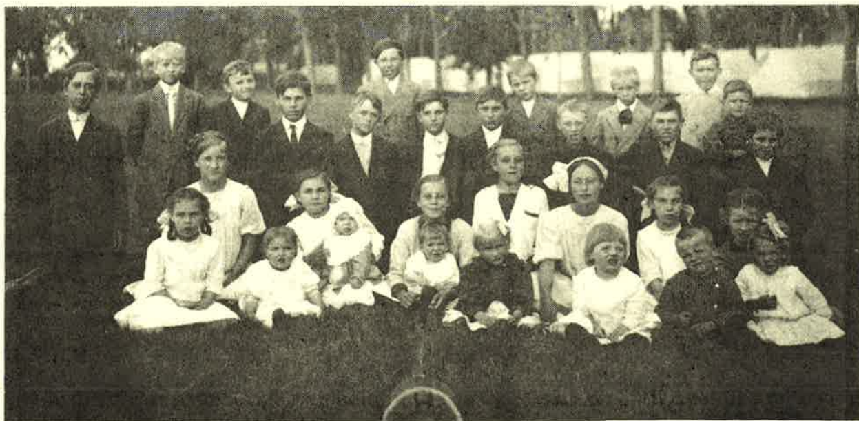
Group of children at Campmeeting, Rocky Mtn. Lake Park, 1913