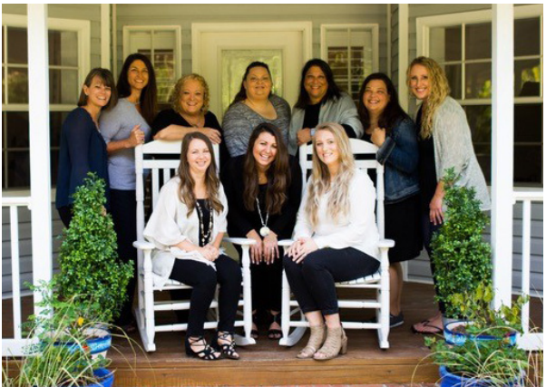
Pregnancy Solutions Center