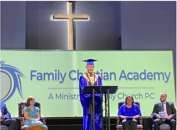
Family Christian Academy