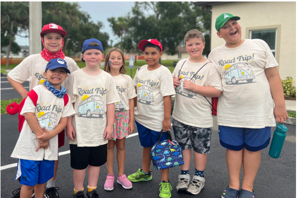
Winshape Camps Each July