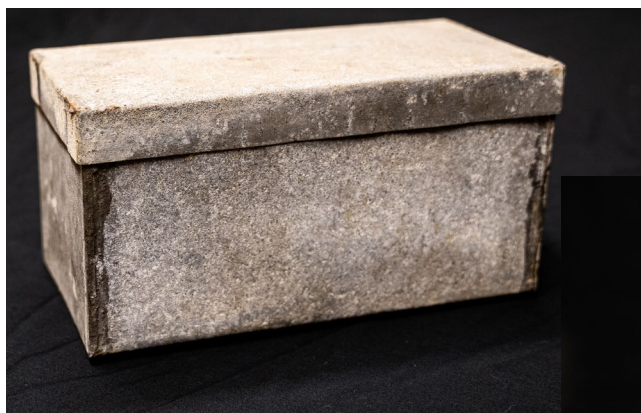
Above: The exterior of the Time Capsule prior to opening it for the first time in over 100 years.

The box and its contents, along with a list of what was identifiable, are in the display case on the north wall outside the sanctuary. Take a look!