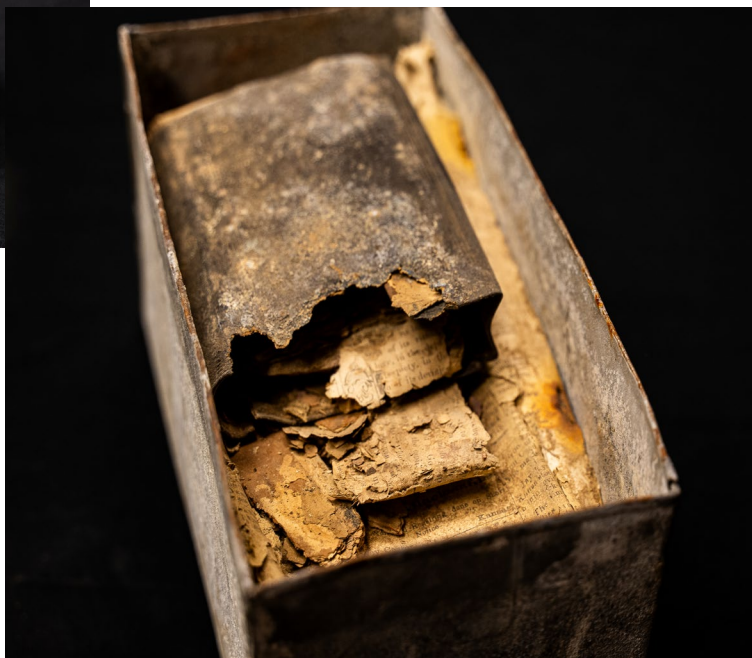
Right: The first glimpse inside the time capsule.