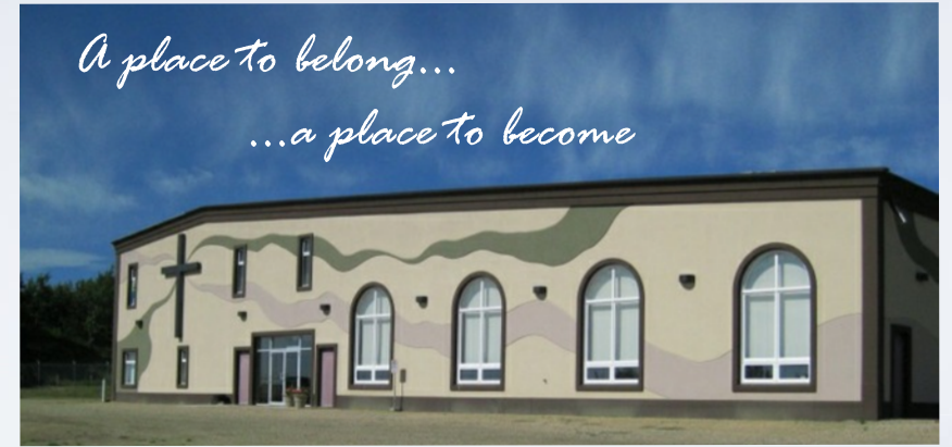
Affiliated with the Pentecostal Assemblies of Canada