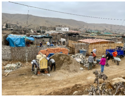
Reaching into Peru

SO PEOPLE MIGHT HEAR , BELIEVE , AND CONNECT .