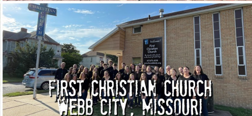
FIRST CHRISTIAN CHURCH WEBB CITY, MISSOURI