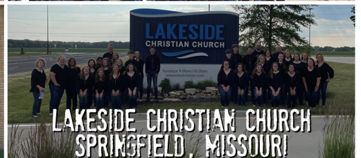
LAKESIDE CHRISTIAN CHURCH SPRINGFIELD, MISSOURI