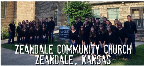
ZEANDALE COMMUNITY CHURCH ZEANDALE, KANSAS