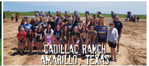
CADILLAC RANCH AMARILLO, TEXAS