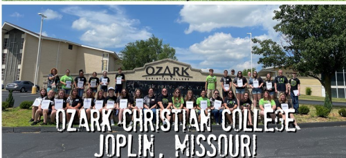
OZARK CHRISTIAN COLLEGE JOPLIN, MISSOURI