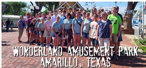
WONDERLAND AMUSEMENT PARK AMARILLO, TEXAS