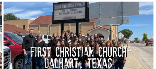
FIRST CHRISTIAN CHURCH DALLART, TEXAS