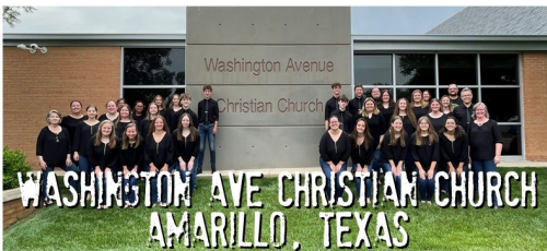
WASHINGTON AVE CHRISTIAN CHURCH AMARILLO, TEXAS