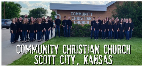
COMMUNITY CHRISTIAN CHURCH SCOTT CITY, KANSAS