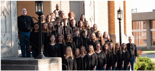
LATHROP FIRST CHRISTIAN CHURCH LATHROP, MISSOURI

lcchurch@lincolnchristianchurch.org or 217.732.7618.