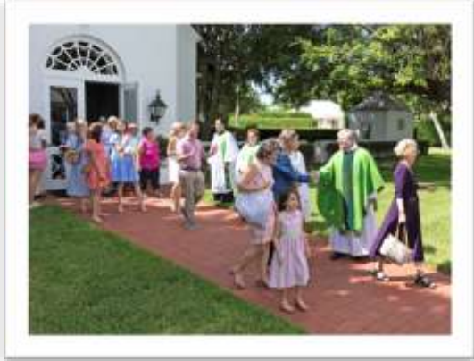
Worship and Welcome