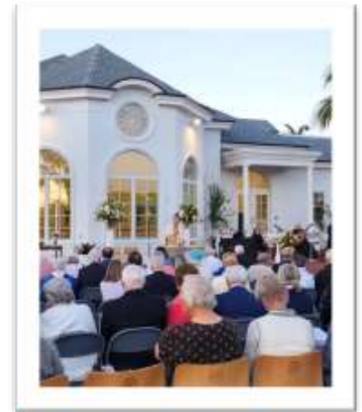
Easter Sunrise on Waterfront

The opportunities for worship, education and formation, service and fellowship invite us into deeper experiences of faith and community. It is hoped that Good News: Our Church's Offerings for You 2025-2026 , invites you into a new or renewed experience at church.