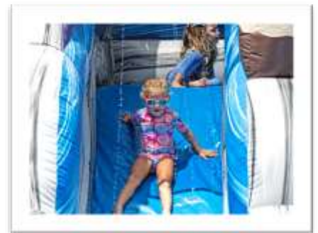
Water Slide Tradition

Each year at the beginning of our Formation Programming in August or September, all parishioners are invited to share in Rally Day, an intergenerational time for fun at church. We typically have a huge waterslide and other fun games for children and youth. Experiencing joy and fun in church is an important part of our community. All ages gather for lunch and fellowship.